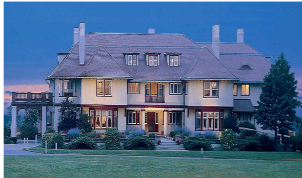
The Ocean Edge Resort Mansion