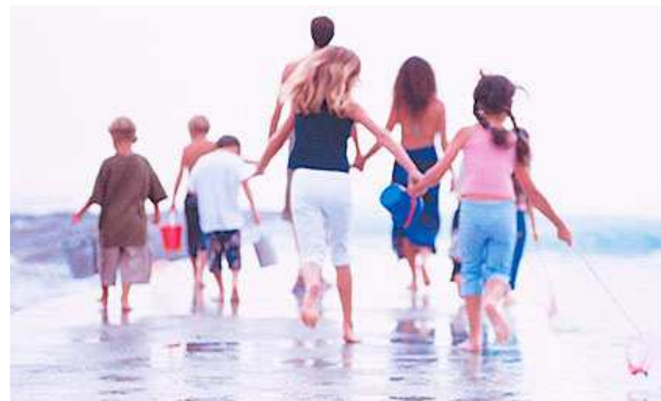
A family at the Cape