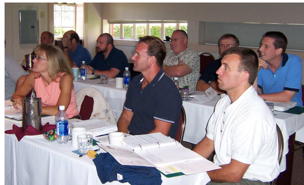
Taking a Class at the Cape