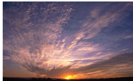
Sunset on the Cape

[Special deal: Stay up to three more nights for the same $185.00/night.]